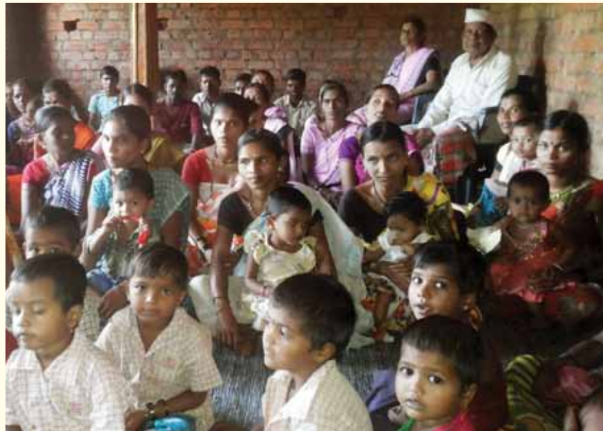
Women and children are the focus of our initiatives in AMCHI.

AMCHI , which means “Ours” in Marathi, is a community empowerment project that works with women, children and communities at large as well as with service providers like health workers, school teachers and gram sevaks for better quality, accountability and transparency in health, education and other services. AMCHI is implemented in 96 villages under nine Primary Health Centers in the Shahapur block of Thane district, Maharashtra.