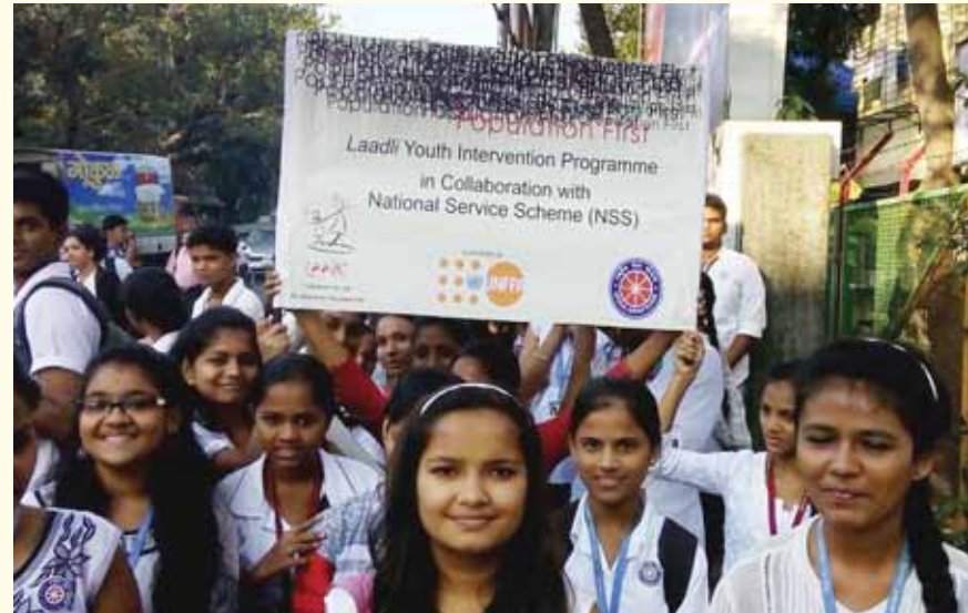
Laadli works closely with college youth on gender issues.

Laadli , Population First's girl child campaign was launched in June 2005 to address the problem of the falling sex ratio highlighted in the Census of 2001. However, over the years the scope of the project was redefined to work with media, advertising and youth to address the reasons why she is considered unwanted and undermined in our society.