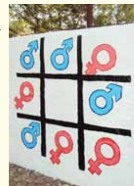
Wall paintings on the theme of Women Empowerment

Laadli Media & Advertising Awards for Gender Sensitivity (LMAAGS) acknowledges and felicitates gender sensitive reportage in the media and portrayals in electronic and print media