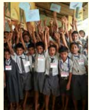
Students during election campaign