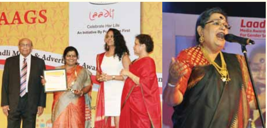
A media awardee being felicitated.