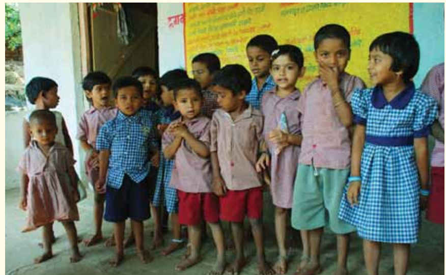
Population First works in the village Anganwadis to address malnutrition.

Population First is a not for profit organization registered in March 2002 under the Bombay Public Trusts Act, 1950.