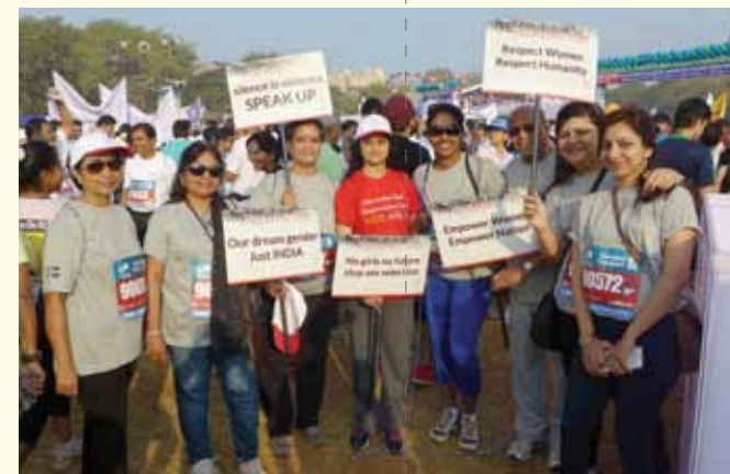
The Population First team runs for Laadli!